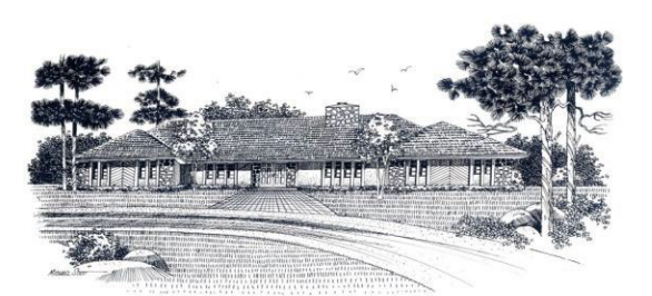
6731 Donald Ross Rd., Palm Beach Gardens, FL 33418